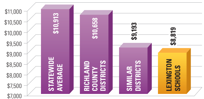
Total Expenditure per Pupil

The graphs to the right compare the Ohio Department of Education 2013-2014 costs per pupil for Richland County districts and other districts around the State. The graphs demonstrate how Lexington Local Schools offer a great value to taxpayers...an excellent education for our students at a lower cost than other schools around the State.