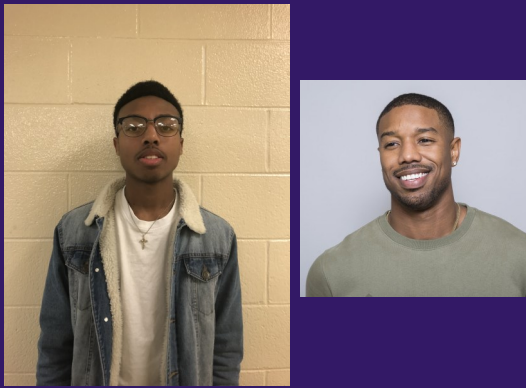
Bryant and Michael Jordan